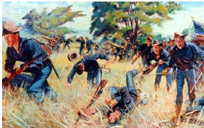
Gatling guns hauled by mules arrive to turn the tide at San Juan Hill