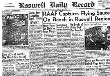
Roswell Daily Record announcing the "capture" of a "flying saucer."