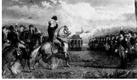
George Washington taking command of the Army.