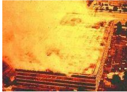
Conflagration underway, 1973