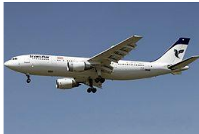
USS Vincennes and a similar A300B2-200